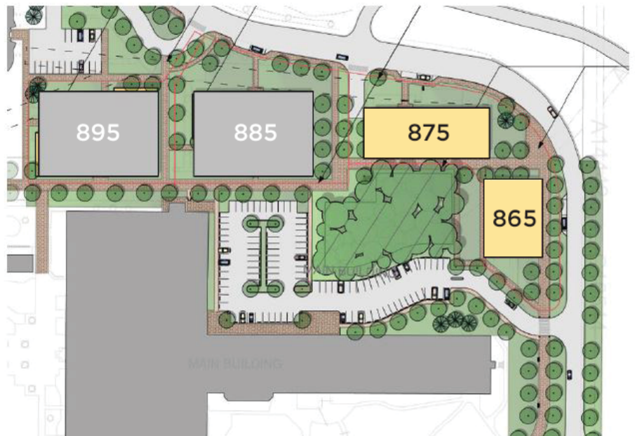
Parcel E - 865 & 875 University Dr Development Statistics:

In accordance with the 2013 TRU Campus Master Plan, developed after extensive stakeholder consultations, The Reach was created to enrich campus life and return funds to support university initiatives such as student bursaries and scholarships.